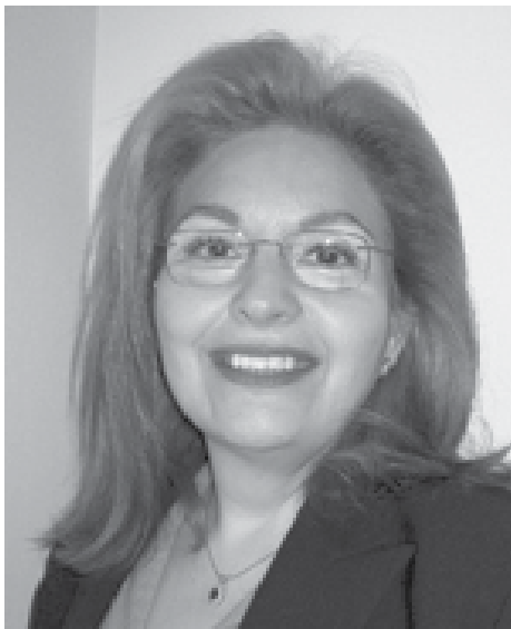
Board Certified Family Practice and Board Certified Emergency Medicine (ABPS)